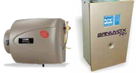
UV light purifier system Whole home system designed to destroy viruses, germs, bacteria, mold, chemicals, odors, allergens & VOCs.

Proper humidity levels in your home reduce static electricity, wood trim damage, and wilting house plants. You'll feel more comfortable as scratchy dry skin, throats and noses are soothed. Properly humidified air feels warmer allowing you to turn down your thermostat a few degrees and reduce energy costs yet still feel comfortable.